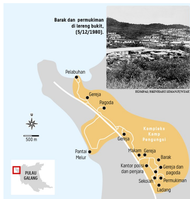
Figure 3. Barracks and settlements

The presence of the Vietnamese Camp on Galang Island shows Indonesia's commitment to the principles of humanity and international solidarity, even though Indonesia at that time was not a party to the 1951 Convention on the Status of Refugees or the 1967 Protocol. However, through a pragmatic approach and multilateral cooperation, Indonesia played an active role in handling the regional refugee crisis, which also strengthened Indonesia's diplomatic position in the international arena (Sukma, 1995; Adiputera & Missbach, 2021; Baskara, 2024). Some historical relics in the Vietnamese camp on Galang Island include: Galang refugee camp which used to have barracks for Vietnamese refugees, places of worship such as the Quan Am Tu Temple and the Catholic Church, Ngha Trang Cemetery, and various other facilities that were used by refugees. The Vietnamese Refugee Camp on Galang Island is a historical place that reflects the role of the Indonesian state in accommodating refugees due to the conflict in Vietnam. This location holds many historical relics from that period, such as barracks, places of worship, hospitals, and monuments, which are still preserved to this day.