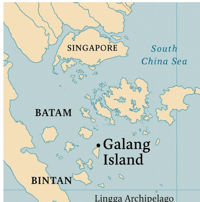
Figure 1. Galang Island