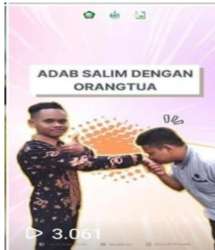
Figure 4. Video Adab Greetings

Picture 4 above is dakwah content on LDK Al-Izzah UINSU's social media which is a parody of funny videos, one of which is content about adab salam. The dakwah content above is delivered with funny video parodies that aim to give a message to the audience on how to make the right greetings according to an Islamic perspective but delivered in a unique and creative way through funny video parodies so as not to be monotonous. The number of impressions in the dakwah content above was 3,061 impressions with 251 likes and 22 comments. Dakwah content that is a parody of funny videos is quite popular with the public because it is easier to digest in the community and more interested in watching.