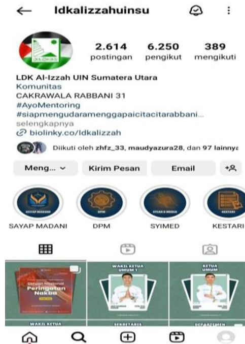
Figure 3. LDK UINSU Instagram Homepage

The Campus Da'wah Institute (LDK) UIN Al-Izzah UIN North Sumatra is a subsidiary organization of the Rectorate of UIN North Sumatra which is dedicated to spreading Islamic teachings and practices in the campus environment. The Campus Da'wah Institute (LDK) UIN Al-Izzah North Sumatra is a campus organization that specializes in dakwah activities. He actively produces dakwah content and shares it on the social media platform Instagram. The Campus Da'wah Institute (LDK) UIN Al-Izzah North Sumatra aims to maximize the spread of ideals. Islamic principles and ethics in the context of social media.