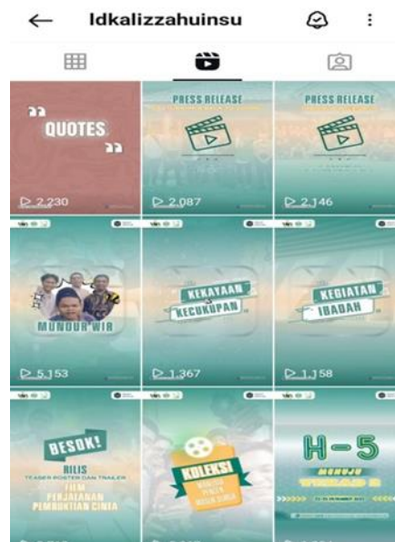
Figure 1. Dakwah Content

The problem faced by LDK Al-Izzah UINSU is that there are several dakwah content on social media that is taken down by Instagram because it discusses sensitive issues such as the Palestinian issue. Another problem faced by LDK Al-Izzah UINSU is Human Resources (HR) in quantity so that it is constrained in creating dakwah content that requires many people. Another problem faced by LDK Al-Izzah UINSU is the time management of the members of the institution so that content creation takes a long time and is inefficient.