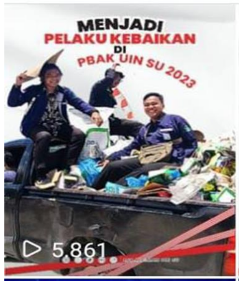
Figure 6. Video of Being a Doer of Kindness at PBAK UINSU 2023

it gives a message to netizens to continue to improve themselves by reflecting on the practices of others so that we are always motivated to improve our worship practices.