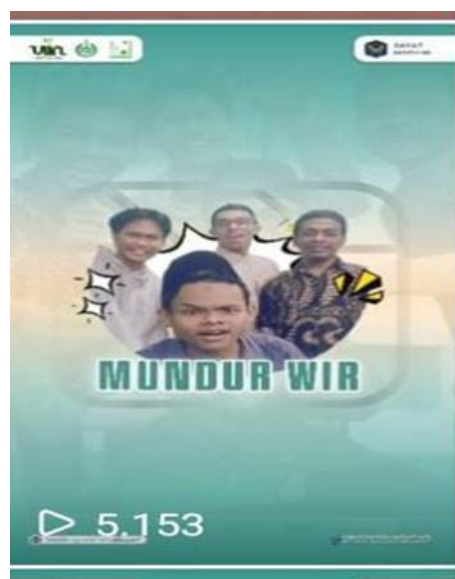
Figure 5. Video Backwards Wir

Picture 4 above is dakwah content on LDK Al-Izzah UINSU's social media which is a parody of funny videos, one of which is content about adab salam. The dakwah content above is delivered with funny video parodies that aim to give a message to the audience on how to make the right greetings according to an Islamic perspective but delivered in a unique and creative way through funny video parodies so as not to be monotonous. The number of impressions in the dakwah content above was 3,061 impressions with 251 likes and 22 comments. Dakwah content that is a parody of funny videos is quite popular with the public because it is easier to digest in the community and more interested in watching.