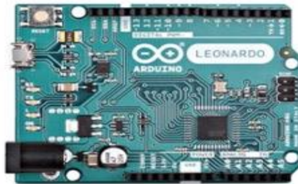
Figure 1. Arduino Leonardo Board

It is considered the first development to the Arduino board with a single microcontroller, so this board is cheap and works very simple and is connected directly to a single input) ONE USP) (Verma, 2017). based on the ATmega32u4, with 20 digital input/output pins.