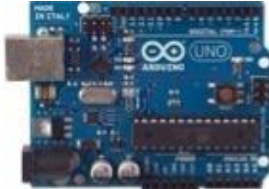
Figure 3. Arduino UNO R3 (Rajan et al., 2015).

Arduino UNO is one of the most popular and widely used models with 14 digital input and output ports. It has a reset button in addition to a power port with a USB port for the purpose of sending data via the calculator or via wireless. It can also be programmed to perform multiple operations, but it does not have a microprocessor (Louis, 2016; Kaswan et al., 2020).