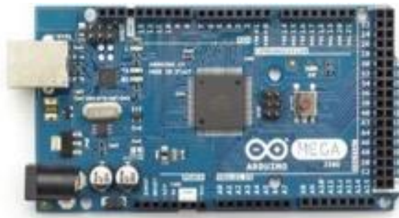
Figure 4. Arduino Mega 2560(R3) (Ashwini, 2016).

It is a microcontroller board depend on the ATmega2560 with 54 digital input/output pins connection, USP connected by PC with AC-DC adapter, and a reset switch. So The Mega is compatible board (Ashwini., 2016). These electronic boards provide a flexible working memory space and are the largest power and processing that allows to work with different types of sensors without delay and are used in complex projects such as temperature sensing, 3D printers, IOT applications, and radon detectors.