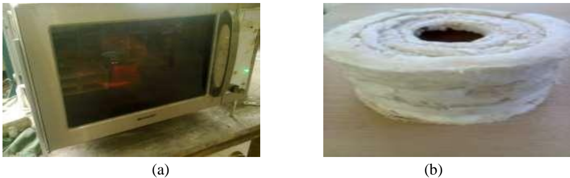
Figure 1. Experimental Microwave Equipment

The pressed powder mixture was placed on a thick bed of ceramic fiber mattresses at the base of the oven. Also, the upper area of the sample wrapped in ceramic fiber was protected with mattresses of the same material provided with a hole of 30 mm diameter. The hole in the upper mattresses was positioned on the same vertical axis with a similar hole in the upper wall of the oven, through which a radiation pyrometer mounted above the oven at about 400 mm can measure the temperature of the heated material. The distribution of the microwave field was performed by a single waveguide provided in one of the side walls of the oven. The microwave power was kept constant during the heating process.