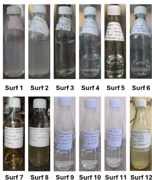
Figure 3. Solubility and compatibility after 21 days.

From the solubility and compatibility results, it was observed that only three of the twelve surfactants tested were incompatible with the reservoir brine conditions. This incompatibility is evidenced by the appearance of a cloudy color in samples S1 and S2, and the occurrence of precipitation in sample S12. Other surfactants S3 to S11 were found to be compatible with the formation brine, as indicated by their clear colors in the test solutions.