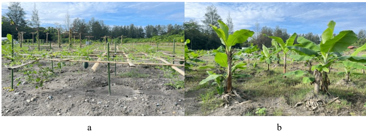
Figure 2. a) Watermelon plants ( Citrullus lanatus ) on SIRSAT MP Land, b) Banana Plants ( Musa Paradisiaca ) in MP Tailings Land

Ecological management at Milepost 21 primarily aims to restore post-mining environmental functions through a series of strategic steps: The reclamation process involved planting more than 160 plant species selected based on their adaptability to tailings. This success was supported by natural succession, which added over 500 additional plant species over a period of 10–15 years. The result was increased vegetation cover that not only serves as land cover but also creates new habitats for local fauna. According to (Puradyatmika & Prewitt, 2012), approximately 160 plant species have successfully grown in the former tailing's deposition area, consisting of both native and non-native species. These species include pioneer plants, trees, shrubs, and grasses. Over time, primary natural succession has been observed to successfully establish pioneer plants such as Phragmites karka , Acacia auriculiformis , and Casuarina equisetifolia . These species play an important role in stabilizing the tailings surface, increasing soil organic matter, and facilitating the growth of more diverse vegetation.