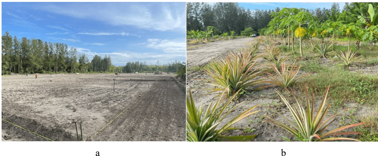
Figure 1. a) Tailings land in MP 21 before planting, b) Tailings land in MP 21 after planting

Productive utilization has grown rapidly with the development of integrated agriculture (rice, vegetables, cattle, chickens, and fish) utilizing tailings land. This indicates that reclamation not only restores ecological function but also provides economic value. Local community involvement has increased, with a partnership between PT Freeport Indonesia and customary landowners in managing the reclaimed land, providing socio-economic benefits. Compliance with ISO 14001 is demonstrated by internal and external audits showing 100% compliance annually, indicating environmental management in accordance with international standards and the principles of continuous improvement.