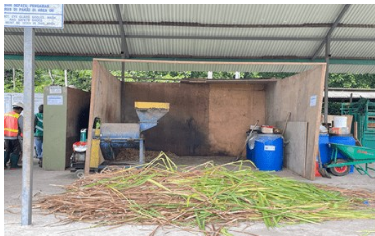
Figure 4. Chopping King Grass ( Pennisetum purpuphoides ) for Cattle Feed at MP 21