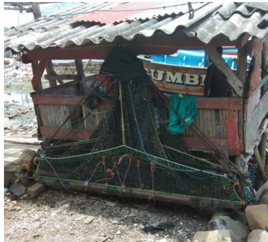
Figure 1. Scratching in Cirebon Regency

Scratch own construction that is rope main, frame (frame made from iron), and bags net.