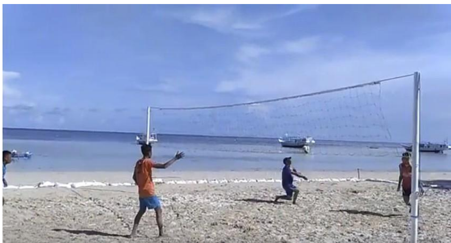
Figure 4. Picture One of the Activities at Samboang Beach

In addition to the activities mentioned earlier, other activities that can be carried out by tourists besides fishing according to the writer's observations are beach sports (volleyball), sunbathing, playing sand, relaxing on white sand and resting in the space provided in the form of gazebos that located on the Samboang beach. Besides that, at a certain time, the event was held, namely the Dato Tiro cultural festival. Besides that, in Samboang Beach there is a rock which is about 20 meters from the shoreline that can be visited by tourists on foot through facilities such as a bridge to get to the place.