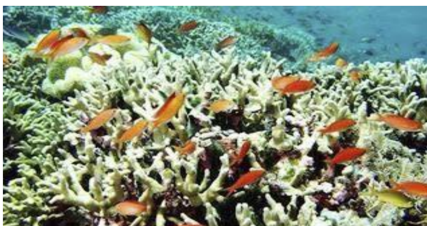
Figure 3. Picture The condition of Samboang Beach

The results of observations obtained by researchers related to coral reefs, researchers can see that the condition of coral reefs located under the sea of Samboang beach is still good and there has not been significant damage so that it can be described and concluded the tourist activities that can be done namely snorkeling by tourist According to one informant source Mr. Suhardiman Syam who has felt the beauty of the underwater and coral reefs of the Samboang beach, he informed researchers that the beauty of the coral reefs on the Samboang beach can be said to be mostly still beautiful, and there hasn't been much damage so that it can be used as one of the advantages of the Samboang beach, but when researchers conducted observations at the DTW the authors get coral debris or coral found on the shoreline generated by the fish bombing by a small number of people who are looking for life on the Samboang Beach, things This is a challenge for the local government and stakeholders in the area to provide an understanding of the importance of coral reef conservation, which leads to an improvement in the economy of the local community.