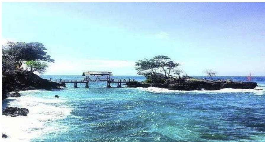
Figure 2. Picture The condition of Samboang Beach