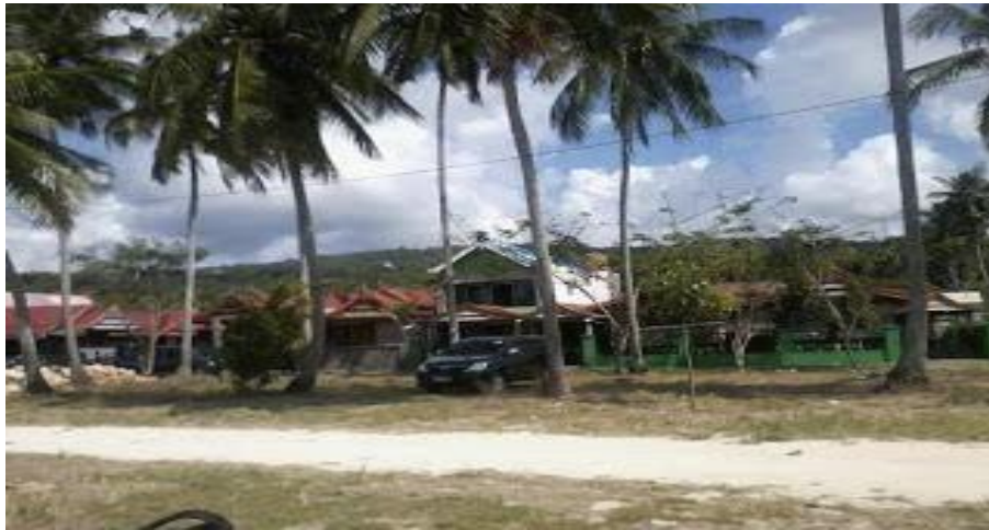
Figure 5. Picture One of the behavior of the community and visitors